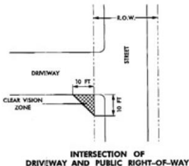
Illustration 3-1 Corner Clearance and Visibility

(A) No fence, wall, structure or planting shall be erected, established or maintained on any corner lot which will obstruct the view of a driver of a vehicle approaching the intersection excepting shade trees which would be permitted where all branches are not less than 8 feet above the road level. Such unobstructed corner shall mean a triangular area formed by the street property lines and a line connecting them at points 25 feet from the intersection of the street lines or in the case of a rounded property corner from the intersection of the street property lines extended. In the case of a driveway/street intersection, the aforementioned technique shall also be used however a 10 foot dimension shall be utilized situated along the driveway and property line. Decorative fencing that would be approved on a corner could include open weave, split rail or similar fencing. Refer to illustration 3-1.